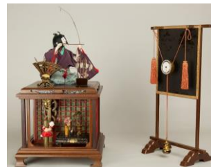
Bow shooting boy