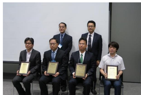
Recipients of the Certificates