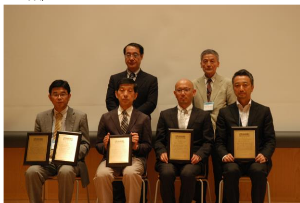
Recipients of the Certificates