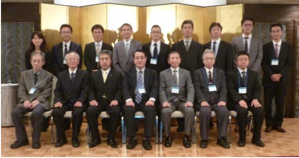
Recipients of the Certificates